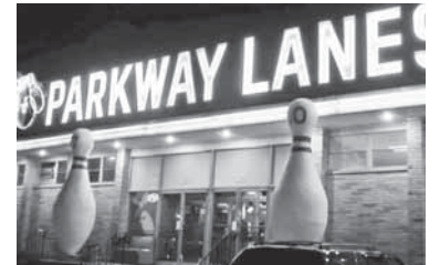
Parkway Lanes 7-10 Tribute Only the 7 pin remains following the remodel of Parkway Lanes, which required the removal of the 10 pin for a wheelchair ramp

Rainbow Lanes, where Roth grew up bowling in junior and adult leagues, and also working as a mechanic, was a two